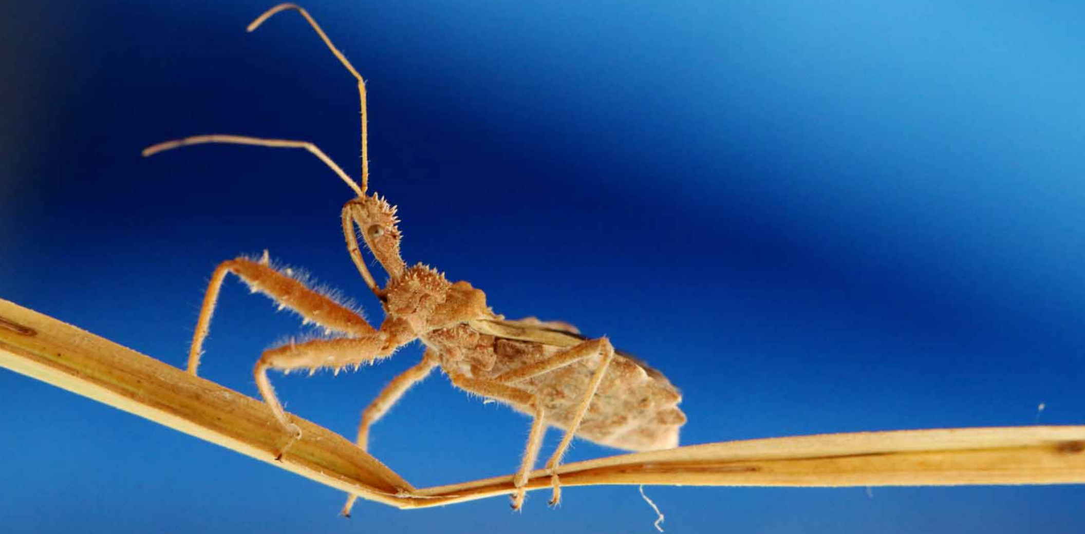
The Assassin Bug ( Stenopoda spinulosa ) uses its robust piercing mouth to attack other insects as prey.